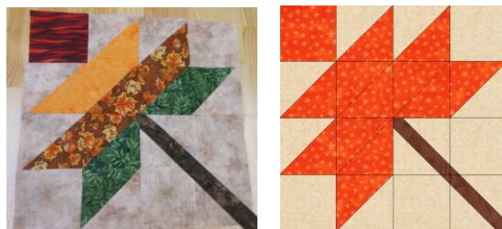
12 inch finished block