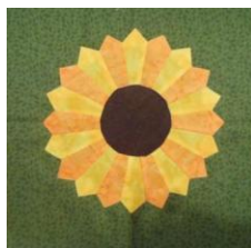
12 inch finished block